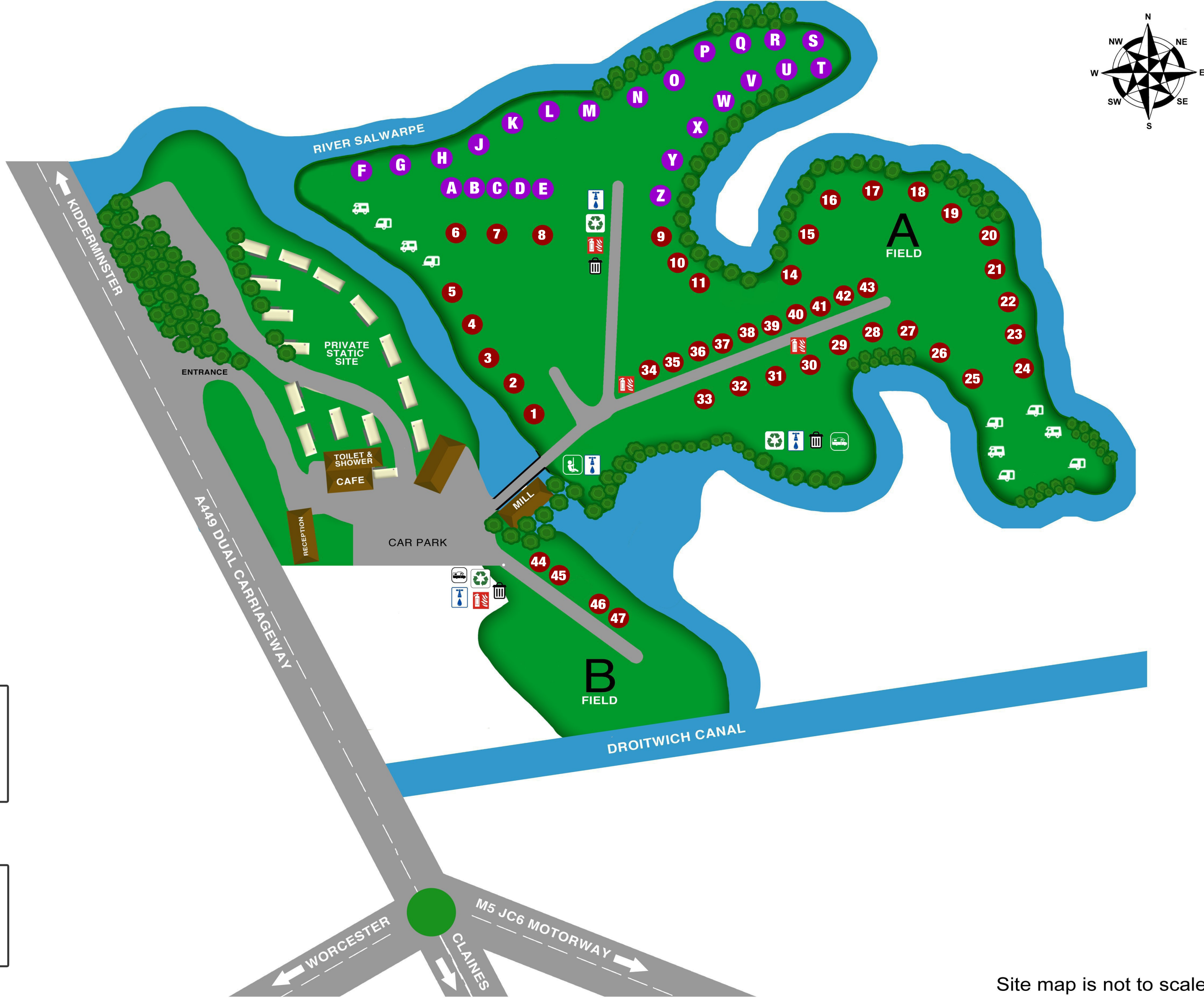
Site map is not to scale